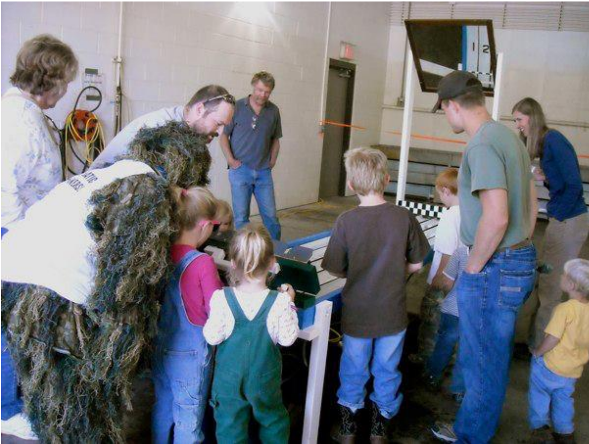
Milfoil Man helping out with Minnow Races at Iron River Fish Hatchery Open House Sept 15, 2012